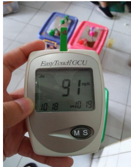
Gambar 8. Alat pengukuran darah