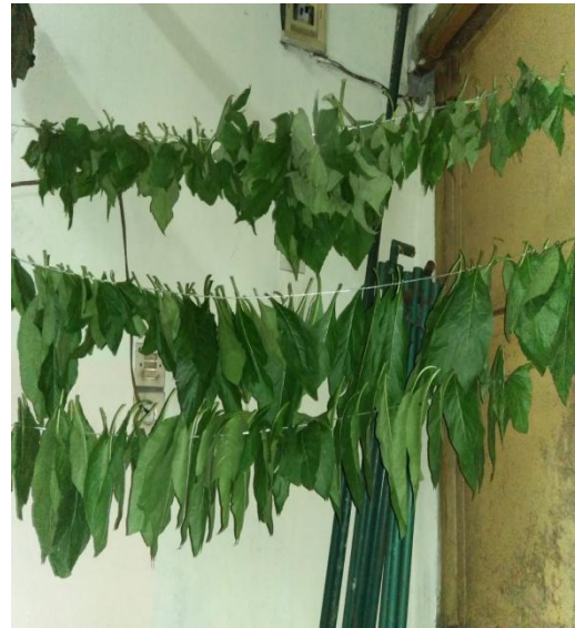
Gambar 2. Pengerinan Daun