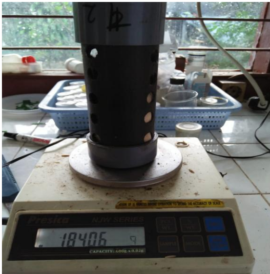
Gambar 7. Penimbangan Tikus Pakai Selongsong