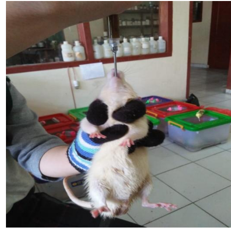
Gambar 6. Pemberian Ekstrak secara Oral