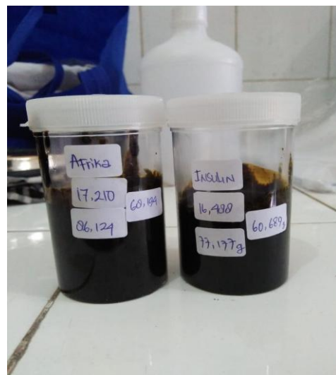
Gambar 4. Ekstrak Kental Daun Afrika dan Daun Insulin