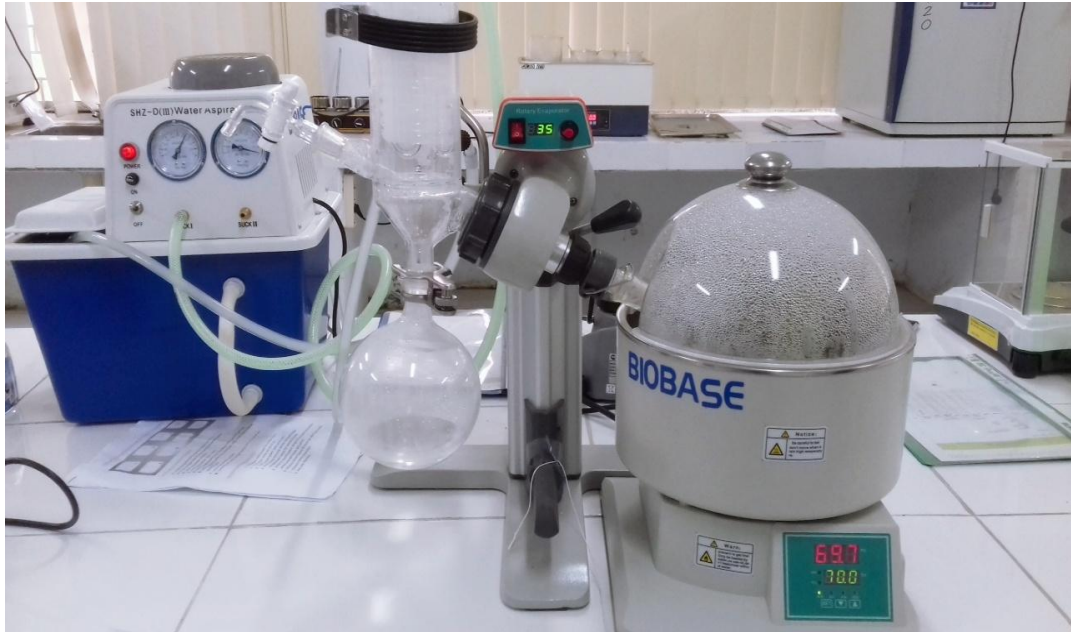
Gambar. 9 Alat Evaporator