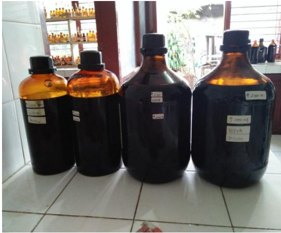
Gambar 5. Cairan Daun Afrika