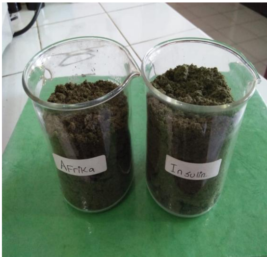
Gambar 3. Serbuk Daun Afrika dan Daun Insulin