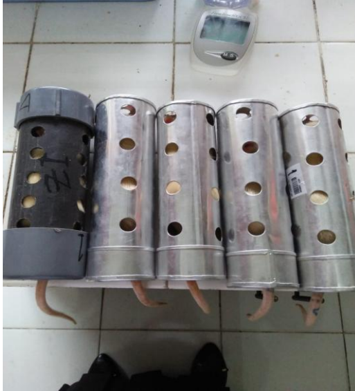
Gambar 1. Tikus dalam selongsong